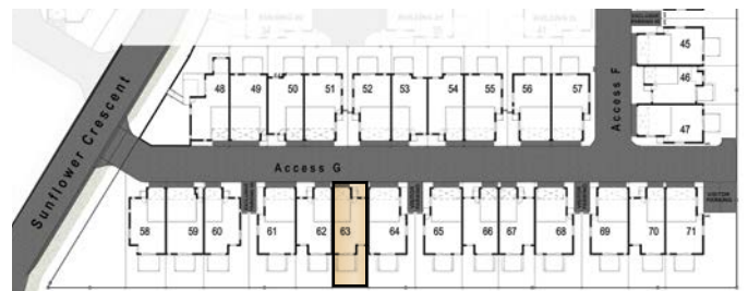
KEY LOCATION PLAN